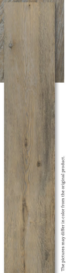
The pictures may differ in color from the original product.