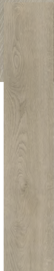
The pictures may differ in color from the original product.