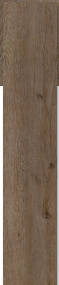
The pictures may differ in color from the original product.