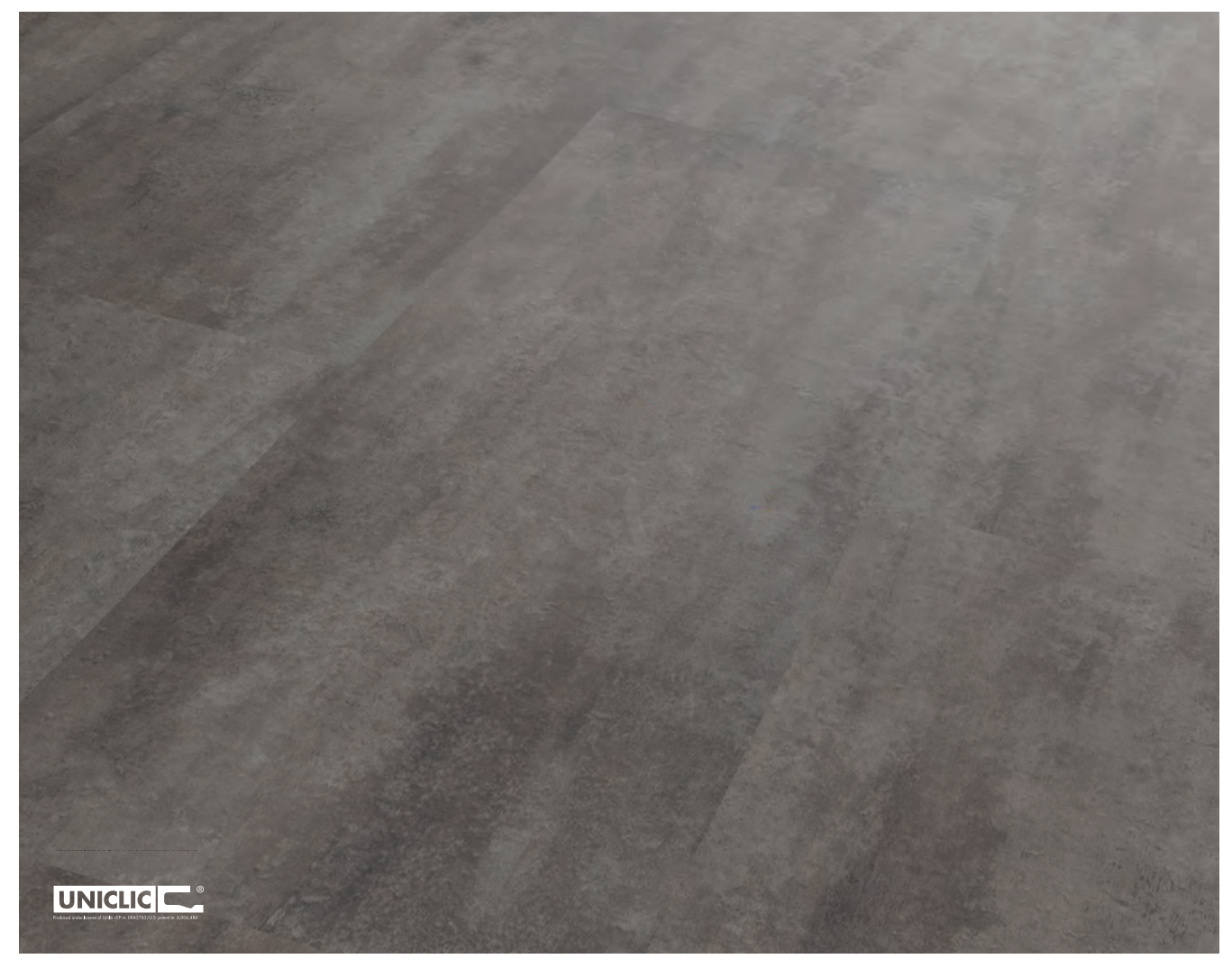
The pictures may differ in color from the original product.