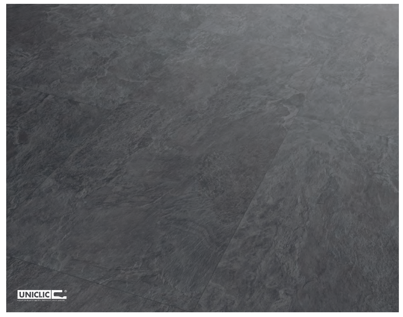
The pictures may differ in color from the original product.