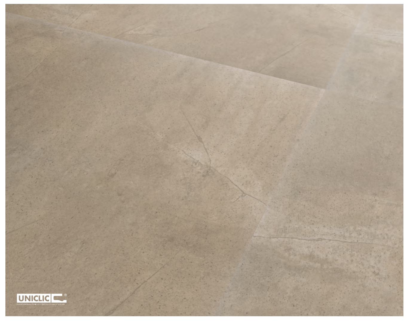
The pictures may differ in color from the original product.