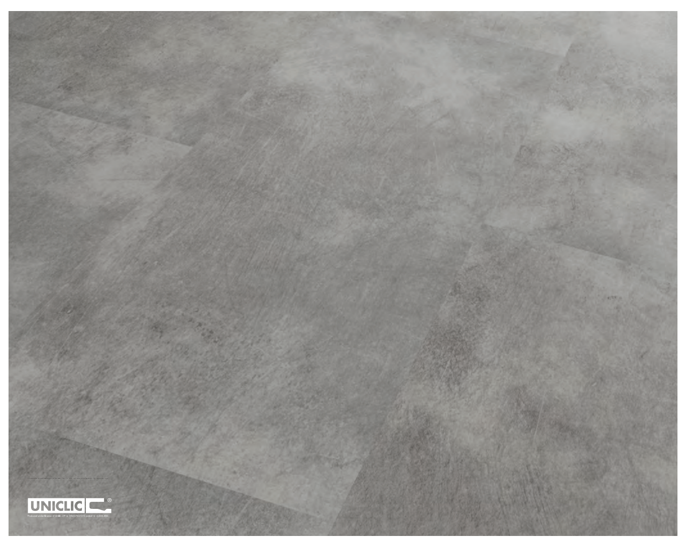
The pictures may differ in color from the original product.